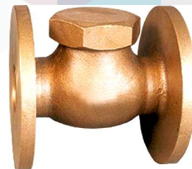
ITEM CODE # GM - 505