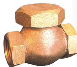
ITEM CODE # GM - 504

Available with Teflon Seating also for air application.